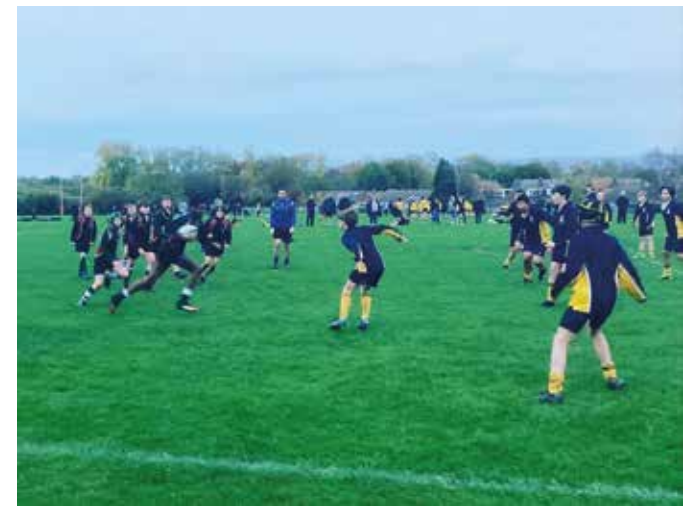
The U15 rugby vs Cleeve on 18th November – a very close and exciting game